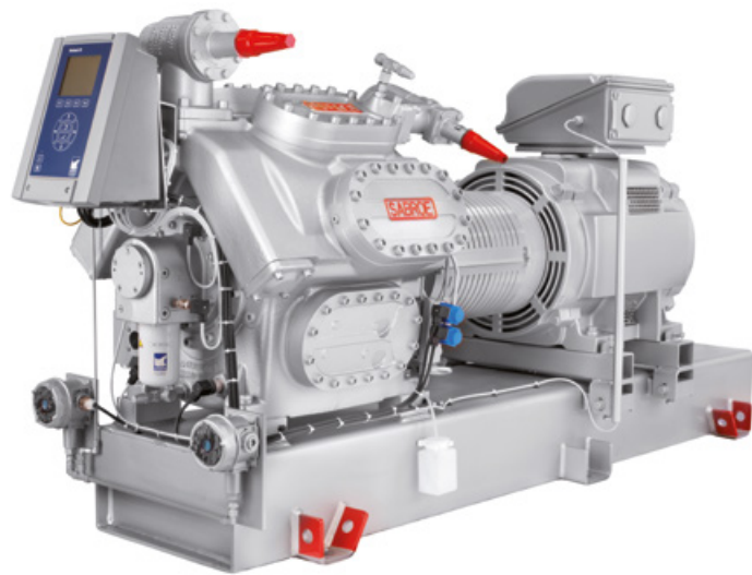
HPC 108 single-stage reciprocating compressor unit (50 bar) with UniSAB systems controller

Sabroe high-pressure compressors provide exceptional reliability and big savings on operating costs, because they are based on the high-volume CMO and SMC compressors, and they share the majority of castings and parts. Our three-year warranty covers the complete unit, including compressor block, UniSAB, motor and coupling – for all refrigerants.